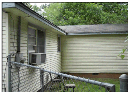
REAR VIEW OF SUBJECT PROPERTY